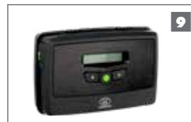
G-ULTRA GSM device The ultimate new GSM solution for monitoring and activating the operator via your mobile phone