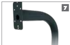
Gooseneck Steel pole for mounting intercom gate station or access control reader