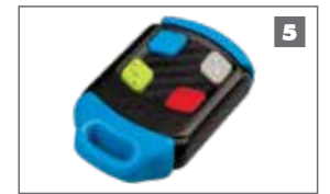
CENTSYS transmitters Available in one-, two-, three- and four-button variants. Incorporates code-hopping encryption