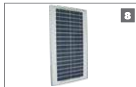
Solar supply Alternative means of powering the system - consult your CENTSYS dealer