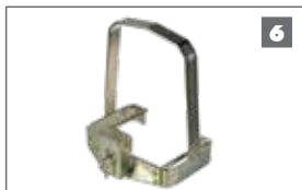
Theft-resistant cage & padlock Retro-installable steel cage that increases the resistance of the operator against theft