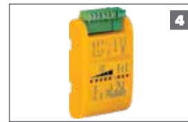
FLUX SA Loop Detector Allows free-exit of vehicles from the property - requires ground loop to be fitted