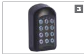
SMARTGUARD or SMARTGUARDair keypad Cost-effective and versatile wired and wireless keypad, allowing access to pedestrians