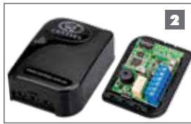
WiZo-Link module Wireless input-output module using mesh network technology creating fully-wireless connections between devices