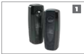
Gate Safety Infrared PE beams Always recommended on any gate automation installation