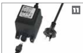
Low-voltage power supply If 240V power at the gate is not feasible, this optional low-voltage power supply kit is a simple, cost effective option