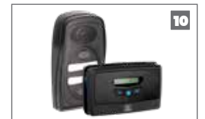
CELLULAR INTERCOM Infused with the DNA of innovation, the G-SPEAK ULTRA allows wireless communication between the user and the intercom gate station, effectively turning the user's phone into the intercom handset